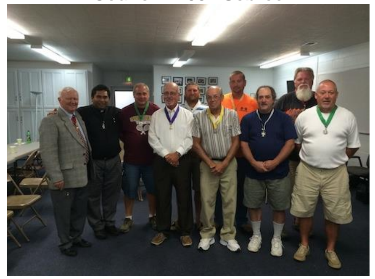
Council #15707 Lexington